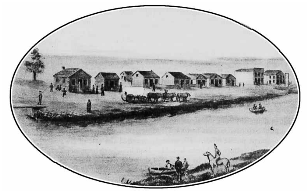
South Water Street in 1834, now Wacker Drive, Chicago.

When the shipment of goods arrived, Carpenter opened Chicago's first drug store in a log building on Lake Street, near the river. There was a great demand for drugs, especially quinine, and the business prospered almost from the beginning. In 1833 the town of Chicago was organized and among the 28 voters, 13 of whom